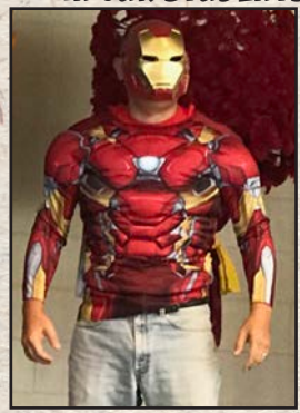
INTRODUCING: IRON MAN

ON OCTOBER 31ST, 2017, OUR KEAUKAHA SUPERHEROES CAME TO ENCOURAGE OUR KEIKI TO CONTINUE TO FOLLOW OUR 7 SCHOOLWIDE BEHAVIOR EXPECTATIONS. OUR HERO PROGRAM CONTINUES TO PROMOTE POSITIVE BEHAVIORS IN OUR STUDENTS. MAHALO SUPERHEROES AND MAHALO FACULTY AND STUDENTS!